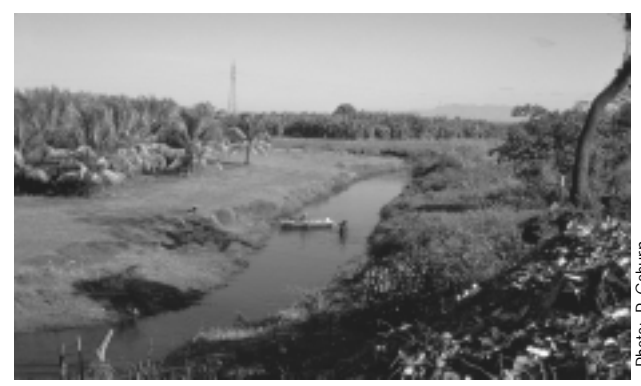
Central America has dengue.